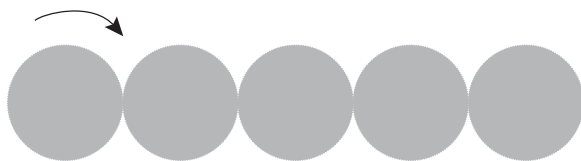
FIGURE 3 | Series of gears in which the first turns clockwise. In which direction will the last gear turn?

A similar kind of re-representation seems to occur in the domain of number. There appear to be three main systems for representing numerical quantities. One of these systems involves a fast ‘subitizing’ procedure that allows everyone from infants to adults to recognize small numbers of items ( \leq 4 ) automatically without having to count. 56 A second system allows animals, infants, and adults to discriminate larger quantities, but only approximately, such as the rough amount of sand in a bucket or fish in a net. 57,58 These two systems are thought to be innate. The third system