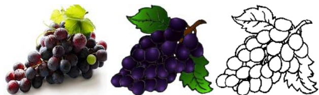
Figure 1: Example photograph (left) and line drawing (right) from Exp. 1-2 and color drawing (center) from Exp. 2.

Materials. Eighty picture pairs were used, with each pair consisting of one black-and-white line drawing of an object from the Snodgrass and Vanderwart (1980) set of normed pictures and one full-color photograph of the same object obtained from the Web, selected to closely match its